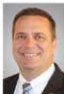
Bill Ganz Mayor Deerfield Beach