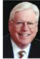
Skip Campbell Mayor Coral Springs