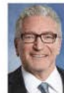
Harry Dressler Mayor Tamarac