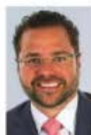
Josh Levy Mayor Hollywood